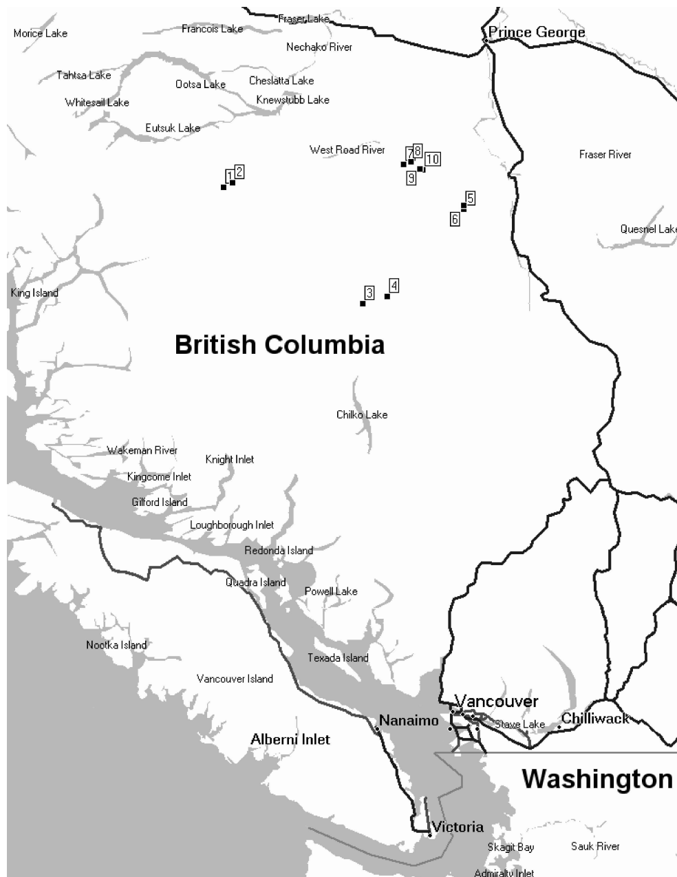
Figure 1. Sites sampled for mountain pine beetles, with numbered locations corresponding to Table 1.

of species. SI values \geq 0.300 were considered an acceptable identification to the level of genus, while lower similarity index values were considered inconclusive. When comparisons resulted in multiple species or genera exceeding these identity thresholds, data corresponding to the highest SI value