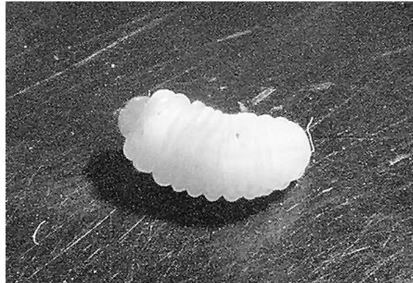
Figure 2. A typical living mountain pine beetle larva included in the cultural isolations.