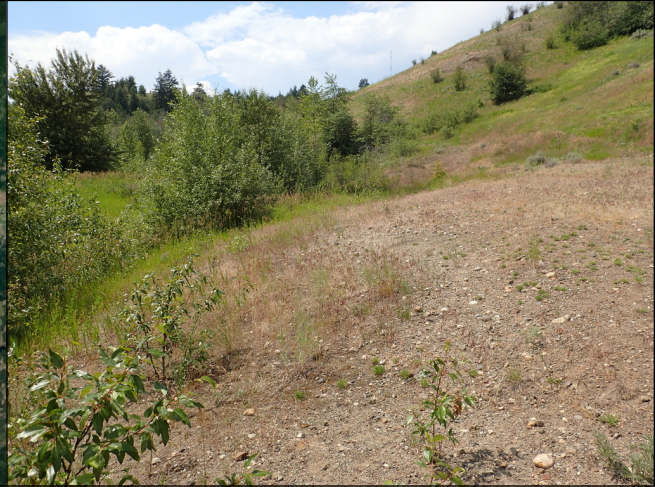
Figure 4. Promachus dimidiatus habitat, photographed by Tyson Ehlers, Vernon, BC (50.22976°N, 119.2986°W), 21 June 2018.

The robber flies perched on the riparian cottonwood shrubs and hunted in the open gravelly area (Fig. 4). Other insects active at the site included Machimus occidentalis Hine (Diptera: Asilidae), Hemipenthes sinuosa (Wiedemann) (Diptera: Bombyliidae), Cicindela pupurea Olivier (Coleoptera: Carabidae), and Ochlodes sylvanoides Boisduval (Lepidoptera: Hesperidae).