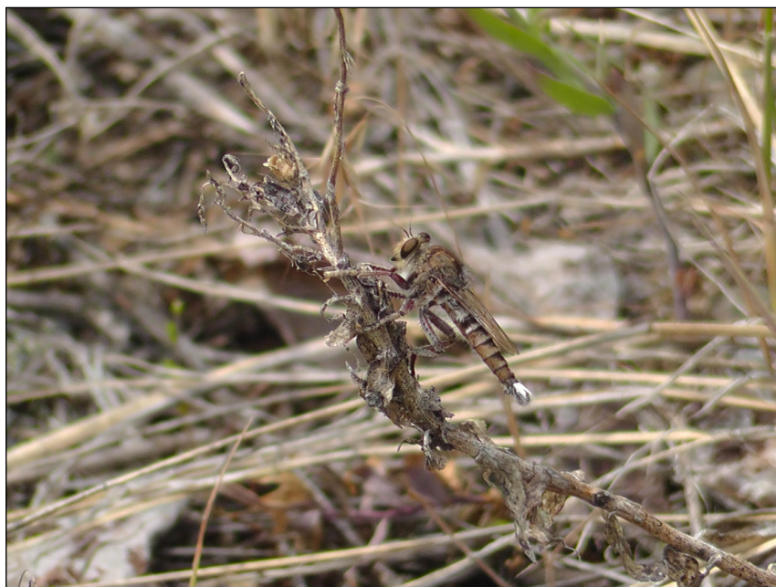
Figure 1. Promachus dimidiatus , male. Vernon, BC (50.22976°N, 119.2986°W), 21 June 2018.

During a survey of arthropods at risk at the Vernon Military Camp, Department of National Defence (DND) in Vernon, BC (Masse Environmental Consultants 2019), Tyson Ehlers and a team of biologists discovered a population of P. dimidiatus at a grassland site (50.22974°N, 119.29874°W) approximately 3.9 km southwest of the centre of downtown Vernon, BC (Figs. 3, 4). This location is not accessible to the general public. Seven males and one female were recorded, although probably some of the same males were reported by more than one person at different times. On 21 June 2018, Denis Knopp photographed a male (Fig. 1); a female was also captured, photographed and released. Ehlers captured, photographed (Fig. 2) and released two males on 21 June 2018 at about 12:45 PDT ( https://www.inaturalist.org/observations/18905860 ). Both RAC and Eric Fisher (El Dorado Hills, CA, in litt. 11 December 2018) identified the flies in the photos as Promachus dimidiatus .