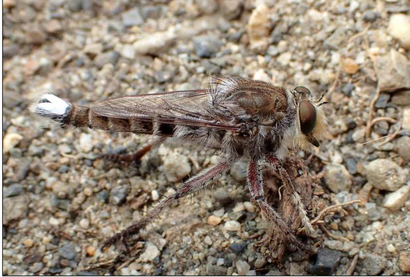
Figure 2. Promachus dimidiatus , male. Vernon, BC (50.22976°N, 119.2986°W), 21 June 2018.

To better document the occurrence of this species in BC, DND employees Angela Manweiler, Todd Kohler and Erik Hayes collected two males and a female on 11 June 2019 at the same location. RAC examined the specimens and confirmed that they keyed to P. dimidiatus . Comparison of genitalic dissections of one of these Vernon males and a male from southern Manitoba (Spruce Woods Provincial Park, 3 July 1986, T.D. Galloway; RBCM collection) show slight differences that are likely within the range of normal variation. Further comparison of the BC and Great Plains populations is planned.