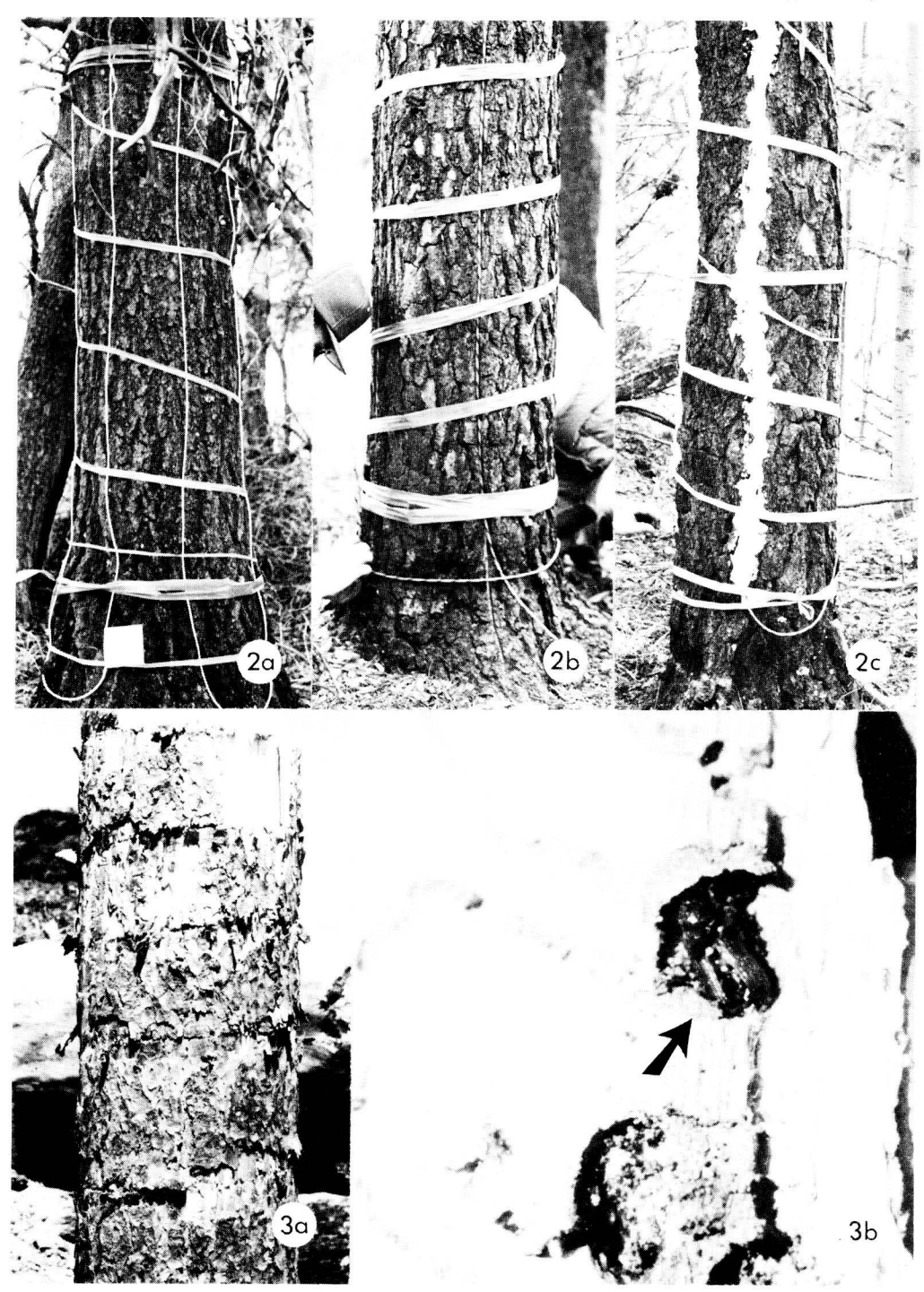
Fig. 3. Destruction of late spring brood habitat and injury of young adult mountain pine beetles caused by firing detonating cord wrapped on the bark surface. A. Strip of bark removed by explosion exposed the sapwood directly beneath detonating cord, B. Mangled young adult (arrow) near the margin of disrupted bark.