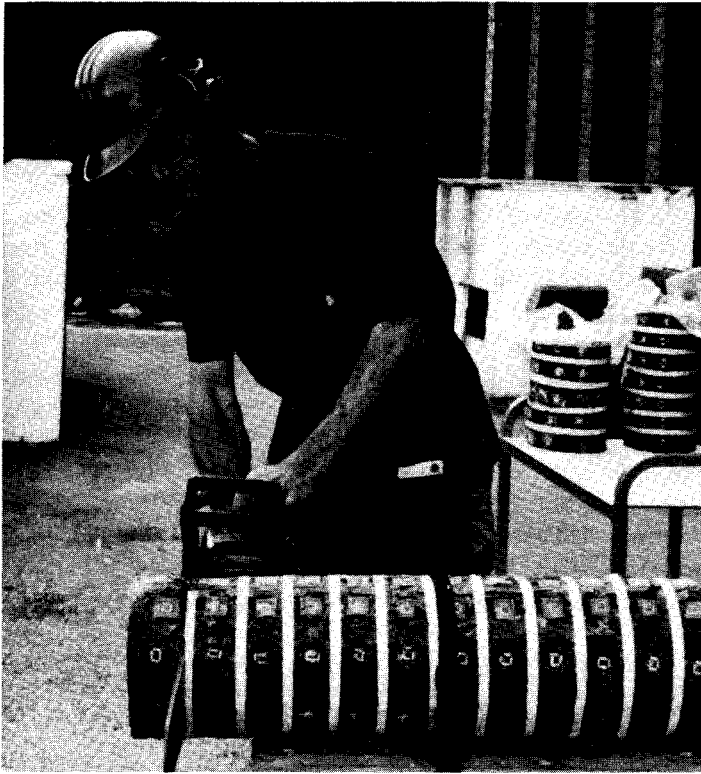
Figure 2. Disk being cut from a 75 cm log for dissection. Masking tape is used to guide the cut.

Determination of Threshold Temperature ( T_o ). Between May 1 and Aug 27, mean daily temperatures in all treatments were derived from the 30 minute averages recorded by the CR10 loggers. Values for the number of days exposure at different controlled temperatures ( T_e ) were calculated from the number of days needed for 50% of the eggs to develop into 50% of the total of teneral adults in the 18 and 20°C chambers.