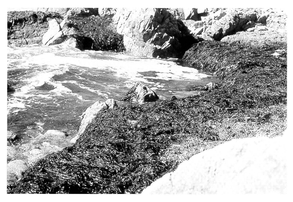
Figure 2. A typical view of the rocky intertidal zone on the west coast of British Columbia. Many insects exploit this habitat and show a whole suite of adaptations for survival in this extreme, inhospitable environment.