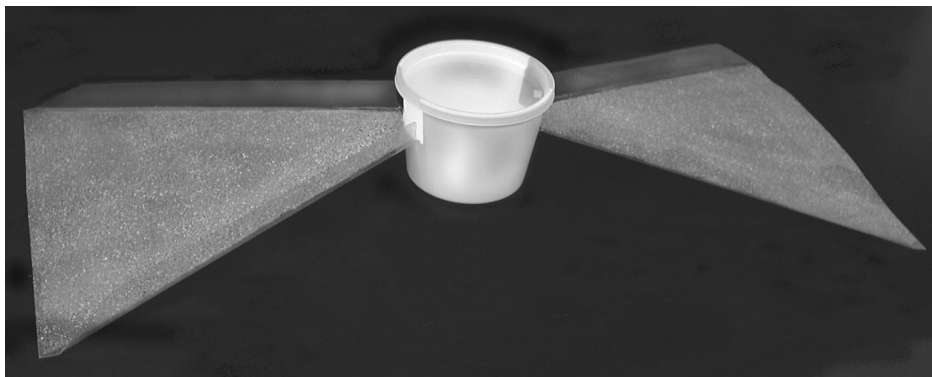
Figure 1. Ramp pitfall trap used for collection of Carabidae in organic apple orchards.

used a combination of mating disruption and sterile insect release to suppress moth populations (Dyck and Gardiner 1992). Orchards contained a mixture of apple cultivars (mainly McIntosh, Spartan, Red Delicious and Golden Delicious) and ranged in size from 0.5 to 4.4 ha. The orchard floors consisted of bare soil and/or vegetation (mainly orchard grass and broad leaf weeds) and were mowed routinely throughout the cropping season. In each orchard three ramp traps were placed beneath the tree canopy, 15 to 30 m apart. Samples were collected in a salt water solution (with a droplet of detergent) which was replaced when samples were removed, at 7 - 10 day intervals from 23 April - 19 October 1999, and 19 April - 2 November 2000. Samples were stored in 70% ethanol until carabid specimens were sorted and identified to species level using the keys of Canadian and Alaskan Carabidae developed by Lindroth (1961-1969b). Voucher specimens are currently held in the Insect Reference collection at the Agriculture and Agri-Food Canada, Atlantic Food & Horticulture Research Centre, Kentville, Nova Scotia.