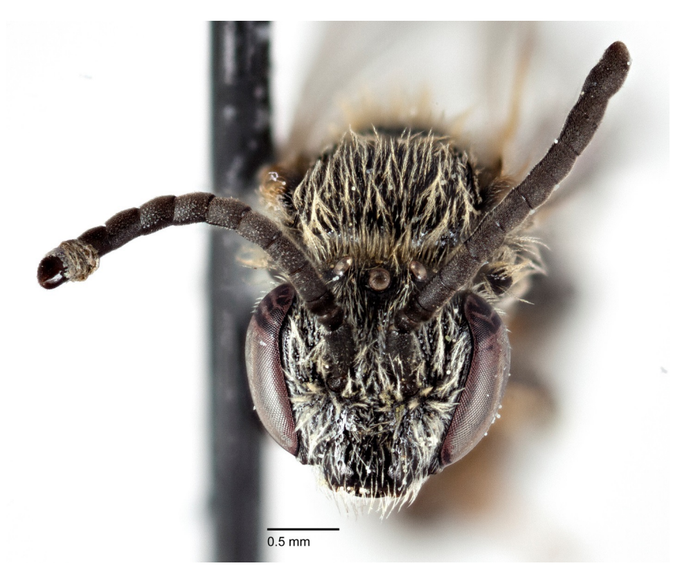
Figure 2. Face of male Lasioglossum sisymbrii (Cockerell) showing the 12-segmented antennae (i.e., 10 flagellomeres; the normal condition in males is 11 flagellomeres).