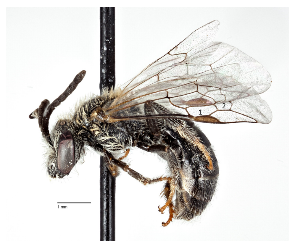
Figure 1. Lateral habitus of male Lasioglossum sisymbrii (Cockerell), with two submarginal cells in each forewing (numbered for the left forewing).